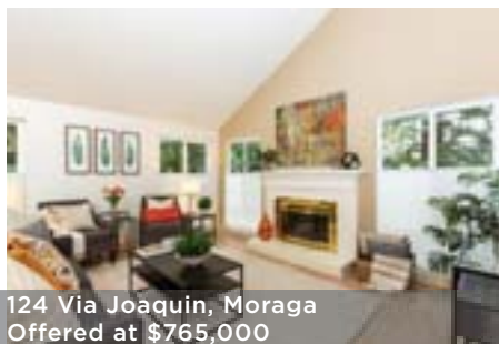
124 Via Joaquin, Moraga Offered at $765,000

4 Bed | 1 Office | 3.5 Bath | 3,000 Sq. ft. 3D tour at www.180WillowbrookLane.com