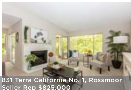
831 Terra California No. 1, Rossmoor Seller Rep $825,000