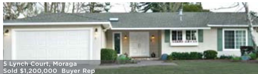
5 Lynch Court, Moraga Sold $1,200,000 Buyer Rep