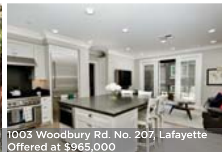
1003 Woodbury Rd. No. 207, Lafayette Offered at $965,000

4 Bed | 2 Bath | 2,285 Sq. ft. 3D tour at www.DonnaMariaWay.com