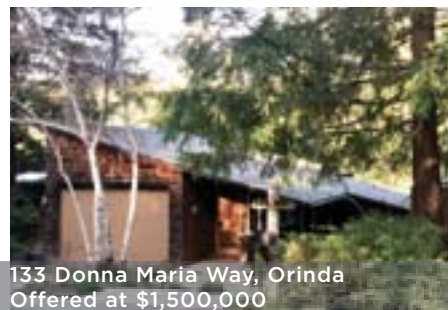
133 Donna Maria Way, Orinda Offered at $1,500,000

2 Bed | 2 Bath | 1,354 Sq. ft. 3D tour at www.124ViaJoaquin.com